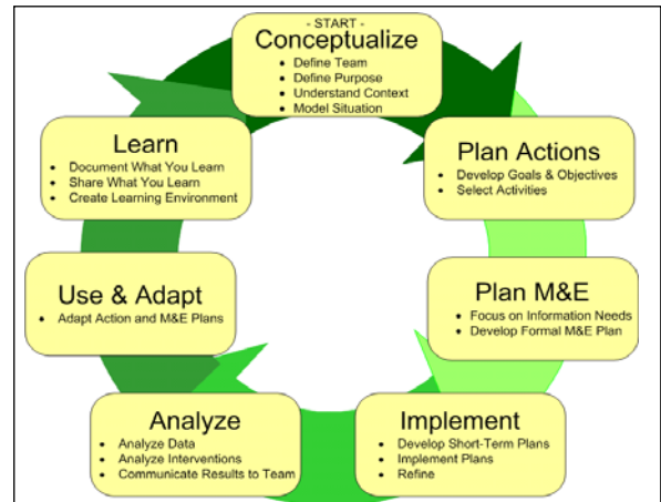
Figure 1. Open Standards Envisioned: The CMP's generalized project management cycle, as described in the Open Standards

Conservation Practice and Alignment with the Standards: Key Findings. Although using somewhat different approaches, CMP member organizations generally audited projects against the major elements outlined by the Open Standards and found that although more than 75% of projects had rigorously conceptualized and planned their strategies, and that these were being implemented through a suite of actions, less than one-third of projects audited had formal, rigorous systems for monitoring and evaluating effectiveness and impact nor processes for using this information to adapt their strategies and actions accordingly (Figure 2). Projects generally did not maintain documentation detailing successes and failures, findings regarding effectiveness and impact, and key decisions, but often had produced externally oriented documentation focused on education, outreach, and fundraising (with particular emphasis on publicizing achievements). Consequently, although conservation projects and organizations may feel confident that their actions are leading to the mitigation of threats and the improvement in